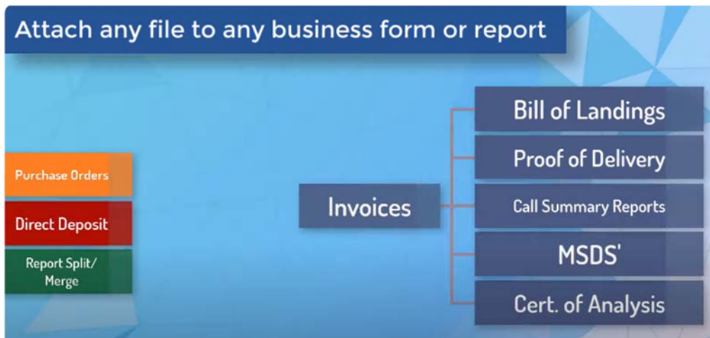
Excerpt from Attachment Example Video

In conclusion, Liaison Messenger EDD is not merely a document management tool; it's a strategic partner that unlocks the potential for automation and precision in document workflows. To explore the transformative possibilities of this high-level document management solution, connect with us today. Elevate your efficiency, reduce manual efforts, and usher in a new era of document management excellence with Liaison Messenger EDD.