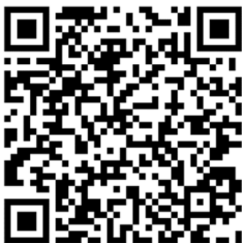
Key Feature Attachment Video (scan-or-click)

follow-up phone calls or emails to inquire about payment timelines. A common stall tactic from customers is to claim, "I mustn't have received the invoice; could you resend it?" This response deflects the inquiry with another question, creating a roadblock to the payment process.